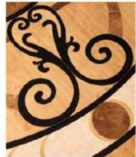
Design and Production: IYC, Fort Lauderdale 0512